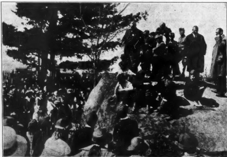
AT THE GREAT ROCK, BESIDE THE GRAVE

Why should Negroes forget this knight who heard their cry of distress and was lured to the gallows for their liberty? We would that this should not be. I brought the matter to the attention of the Philadelphia branch of the National Association for the Advancement of Colored People.